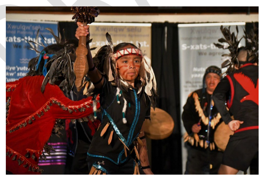
CELEBRATING THE SIGNING OF THE XWULQW'SELU GOVERNMENT TO GOVERNMENT AGREEMENT. MAY 2023.

Established model for WSP implementation that uses a whole-of-watershed, indigenous co-governance framework.