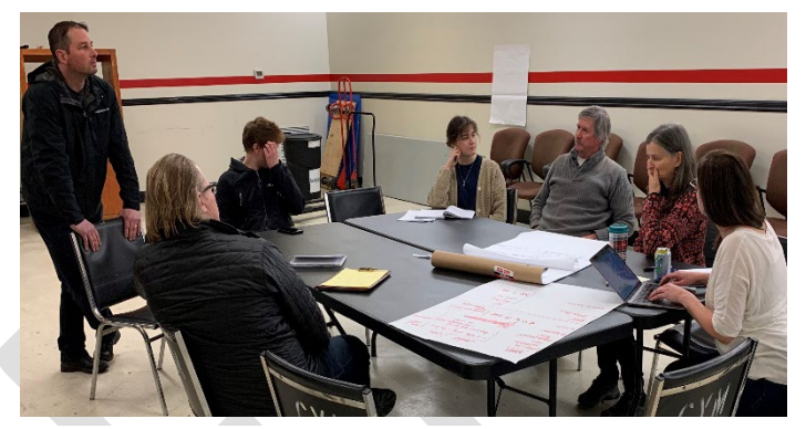
MORE THAN A DOZEN ORGANIZATIONS AND AGENCIES ARE WORKING COLLABORATIVELY TO UNDERSTAND WHY THE FISH KILL OCCURRED, AND HOW TO PREVENT A RE-OCCURRENCE. MARCH 2024

levels fell below the natural outflow. In the Koksilah, first voluntary irrigation sequencing, then a Temporary Protection Order, restricted water use needed by many small businesses. This was done to maintain Koksilah River flows at a minimum of 1.8 cubic meters/second, which is considered a critical fish habitat threshold, but far below ecologically recommended flows. Long-term solutions are being pursued by CWB and partners, in the form of: