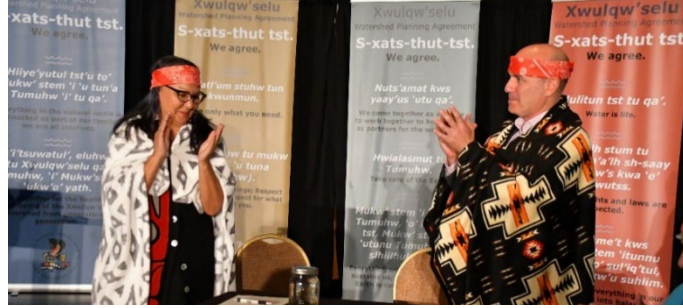
CHIEF HWITSUM AND MINISTER CULLEN SIGN THE XWULQW'SELU WATERSHED PLANNING AGREEMENT. MAY 2024.