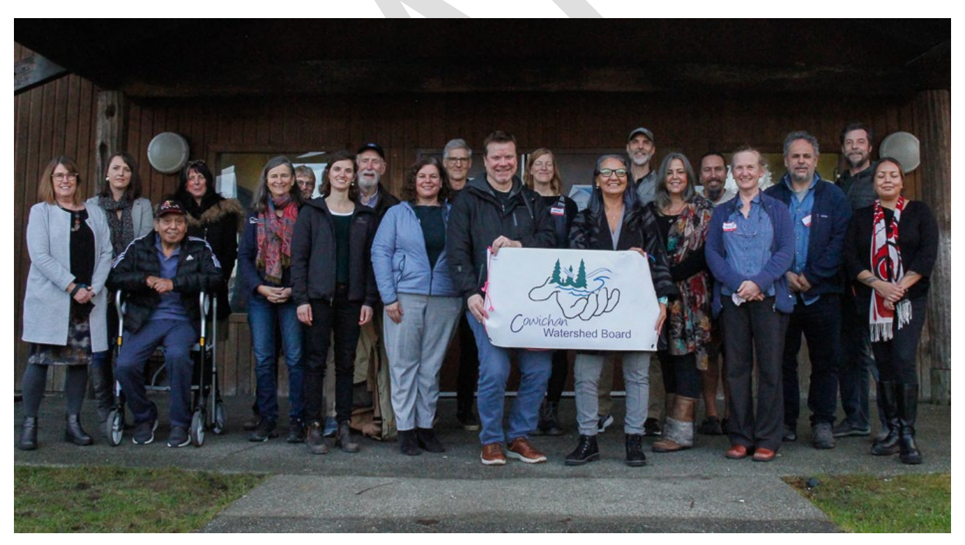
COWICHAN WATERSHED BOARD MEMBERS, STAFF, PARTNERS, AND ADVISORS GATHER FOR A FULL DAY "SETTING THE COURSE" WORKSHOP. SIEM LELUM GYM, JAN 2023.