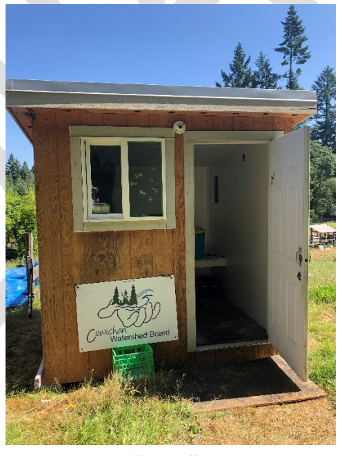
OUR FIRST "OFFICE"! JUNE 2023 — THE WATERSHED-SHED!

For more information, visit <a href="https://cowichanwatershedboard.ca/cowichan-watershed-board-targets/">https://cowichanwatershedboard.ca/cowichan-watershed-board-targets/</a>