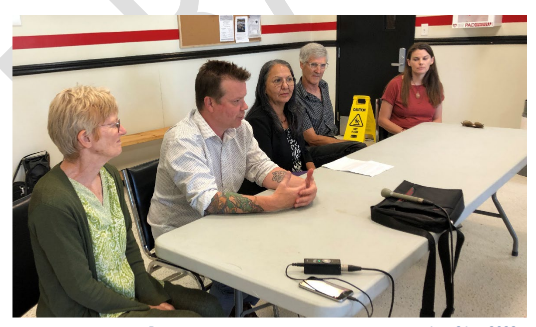
BRIEFING FOR LOCAL MEDIA ON DROUGHT SITUATION, JULY 31ST, 2023