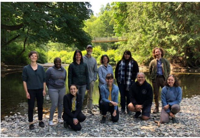
Xwulqw'selu Watershed Planning Team with G2G Leaders June 2023, Bright Angel Park