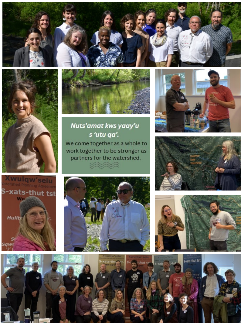
Scenes from some of the 2023 Xwulqw'selu Watershed Planning events. Huy tseep q'u to all the photographers!