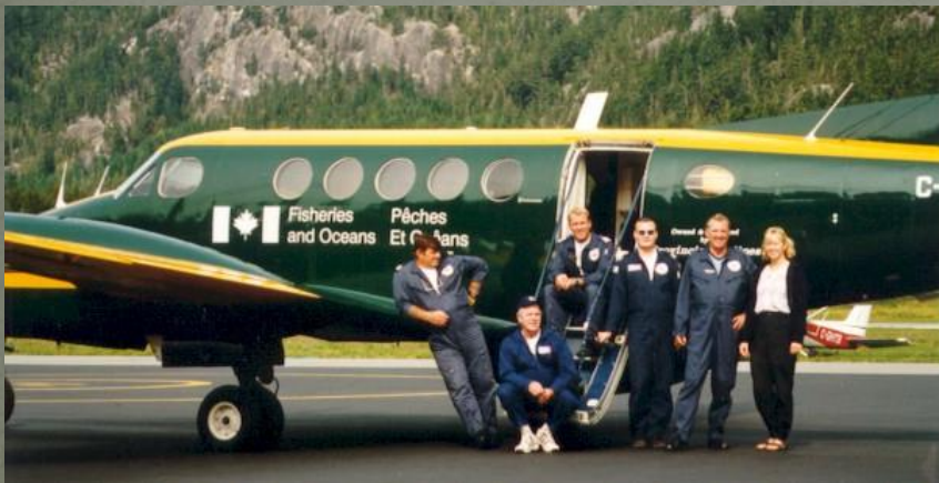
King Air 200 – Coastal patrols