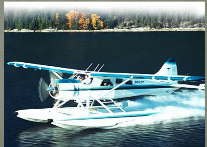
PCG 1000 DeHavilland Beaver