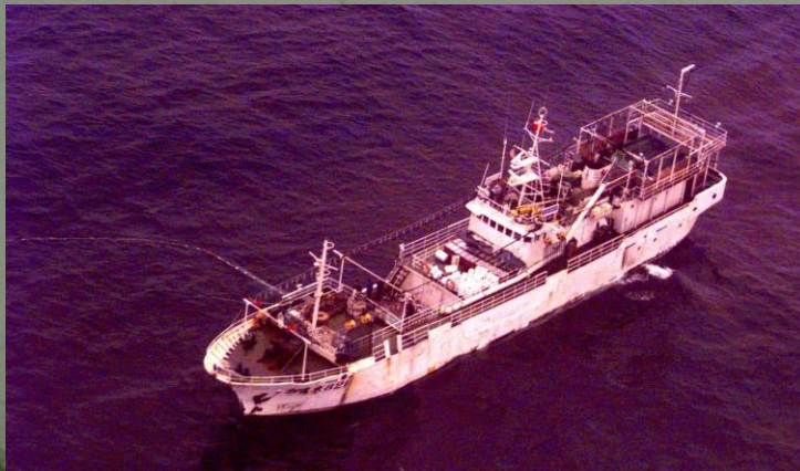
High Seas Drift Net Vessel North Pacific