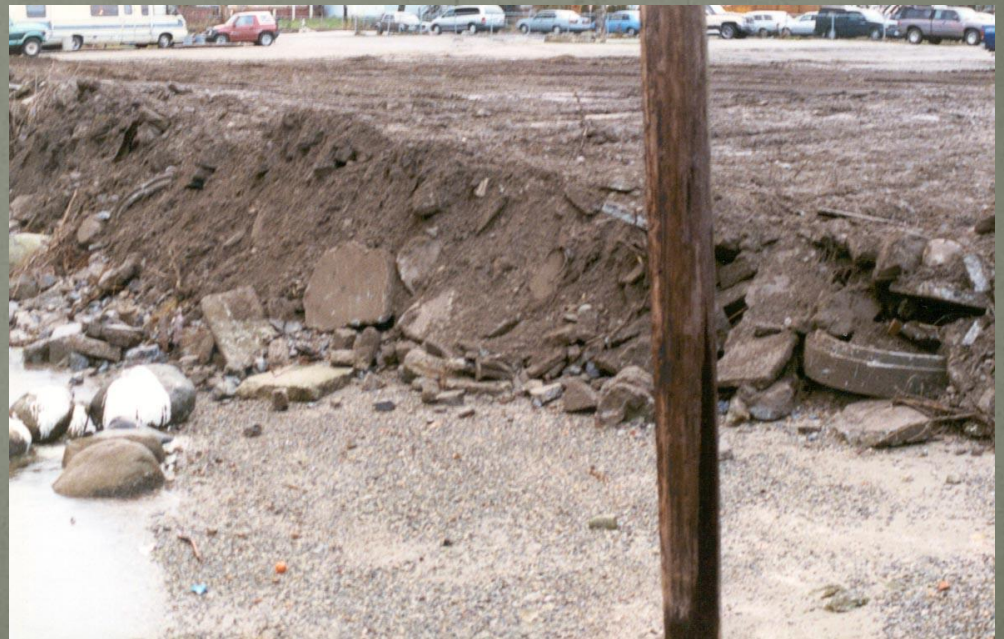
Illegal foreshore landfill

To address threats to fish from habitat loss/degradation and changes to natural flow regimes, the Fisheries Protection Program (formerly the Habitat Protection Program) administered the habitat protection provisions of the Fisheries Act, which remained essentially unchanged from 1977 until 2012.