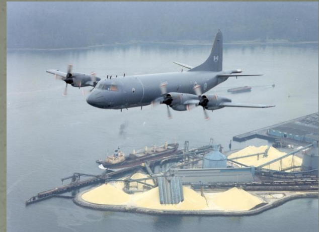
DND CP140 Aurora – offshore surveillance