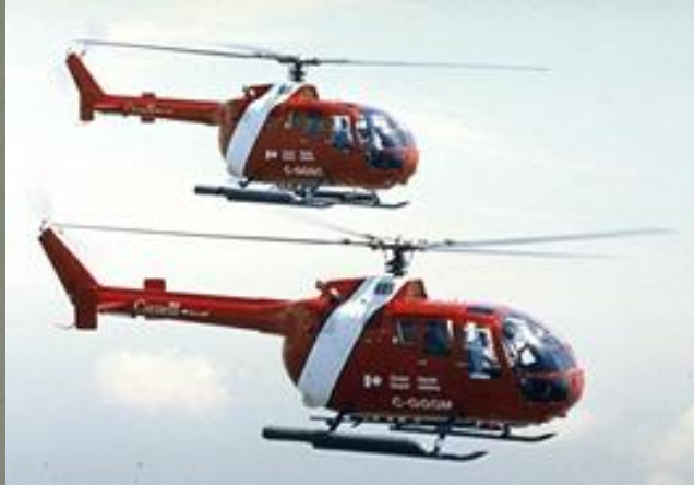
BO-105's provide inshore air support