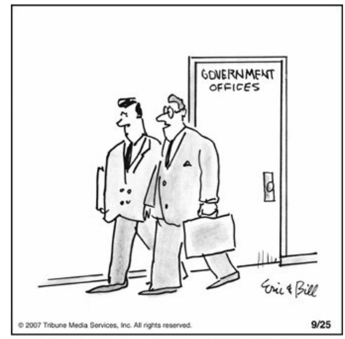
"I didn't get the government job. They said I lacked experience in deficit spending ."