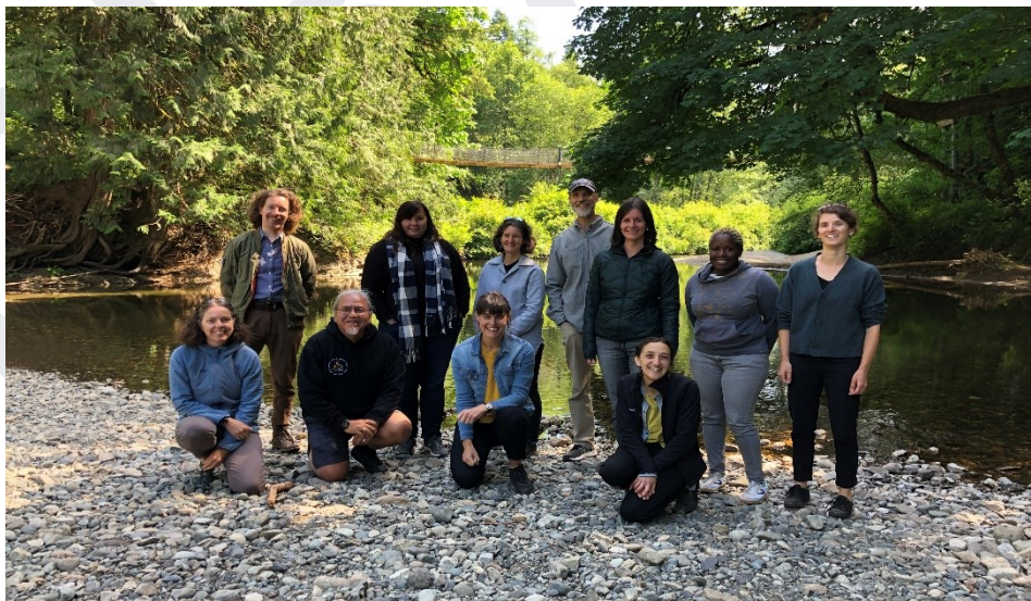
Xwulqw'selu Watershed Planning Team June 2023.

For more information please visit: https://www.koksilahwater.ca/watershed