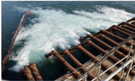
Electric pumps were needed for 36 consecutive days in 2023 to keep the Cowichan River flowing.